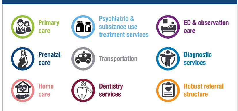
Table 2: Essential Health Care Services

Please contact Priya Bathija at pbathija@aha.org to provide feedback about your board and leadership discussion.